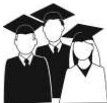
SLC Scholarship Fund

If you have any questions, please call the church office, 610-779-3480.