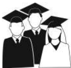
SLC Scholarship Fund

If you would like to be added to the email list, please call the church office.